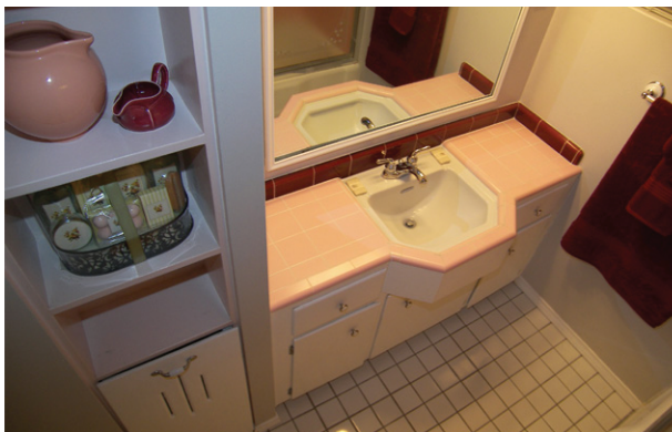
Charming mid-century details abound throughout the home...