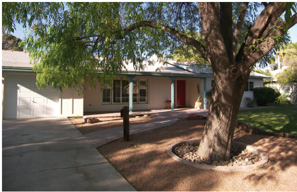
A classic Phoenix ranch home, spacious and luxurious...

Home is where the heart is? A home like this is the beating heart of lives lived wisely and well.