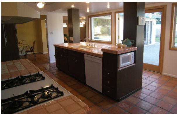
The roomy kitchen is the heart of this home...