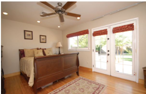
Charming old-world details abound throughout the home...