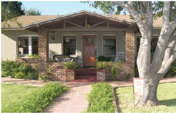
A classic Craftsman bungalow, spacious and luxurious...

Home is where the heart is? A home like this is the beating heart of lives lived wisely and well.