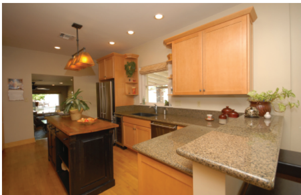
The roomy kitchen is the heart of this home...